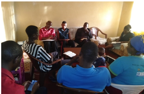
Bible Study at Oasis Fellowship House